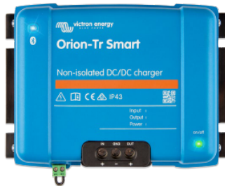
Orion-Tr Smart non-isolated 12/12-30