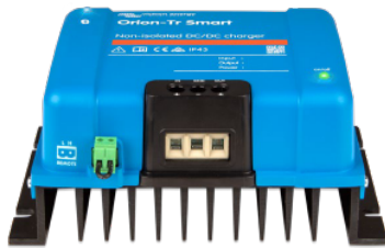
Orion-Tr Smart non-isolated 12/12-30