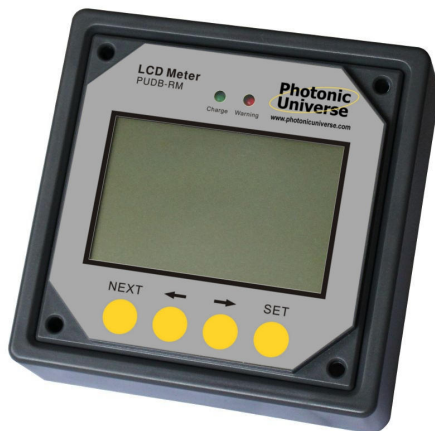
Remote LCD meter for dual battery controller (optional)

If you would like to buy this meter for your dual battery solar charge controller please visit our online shop