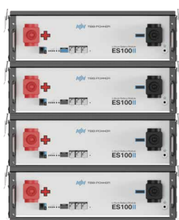
Simple Mounting bracket