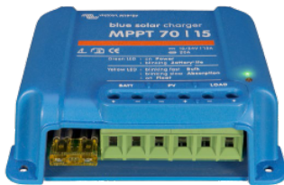
Solar Charge Controller MPPT 75/15