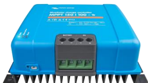
Solar Charge Controller MPPT 150/100-Tr