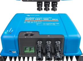
Solar Charge Controller MPPT 150/100-MC4