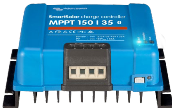
SmartSolar Charge Controller MPPT 150/35