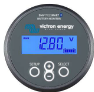
Bluetooth sensing: BMV-712 Smart Battery Monitor