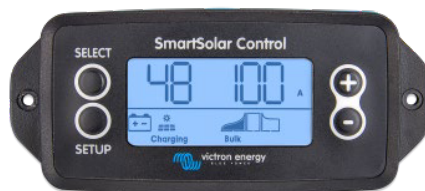
SmartSolar pluggable display