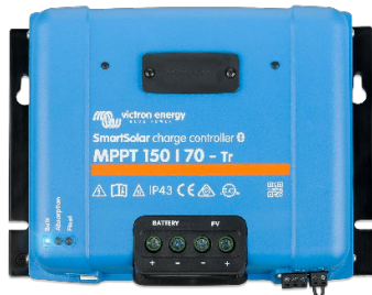
SmartSolar Charge Controller MPPT 150/70-Tr without optional display