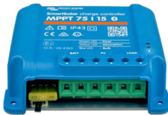
SmartSolar Charge Controller MPPT 75/15